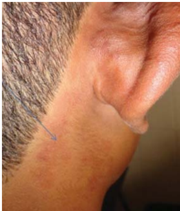
FIGURE 2: Volume increase of the right ear large helix and presence of erythematous macule in the retroauricular area