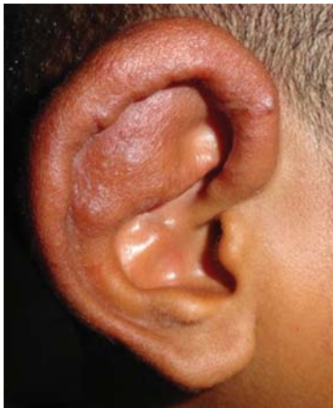
FIGURE 1: Volume increase of the right ear large helix with macules and two erythematous papules on the anterior portion of the helix

Since it was a benign lesion, expectant management was adopted and no other vascular malformation was evident after imaging exams.